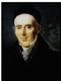
Samuel Hahneman, MD

Homeopathic medicine is now having a resurgence in the U.S. It is a 200 year